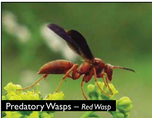
Predatory Wasps – Red Wasp