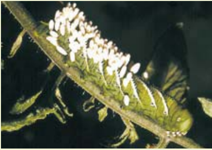
Parasitic wasp pupae on a tomato hornworm