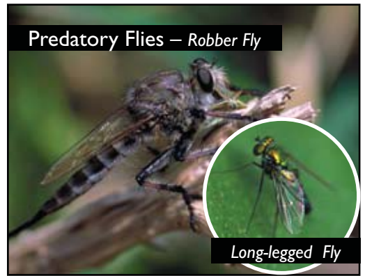
Predatory Flies – Robber Fly