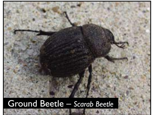
Ground Beetle – Scarab Beetle