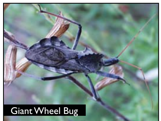
Giant Wheel Bug