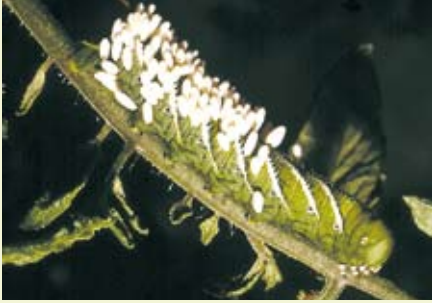
Parasitic wasp pupae on a tomato hornworm