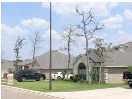
Fig. 1. Declining trees at high risk to Hypoxylon canker.

Signs. As these symptoms in the tree progress, the outer bark falls from the tree to expose the causal fungus, called Biscogniauxia (Hypoxylon) atropunctatum . The signs of the fungus are: