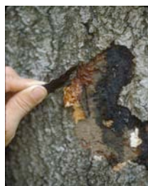
Fig 1. Hypoxylon beneath bark of disease tree.

The disease is caused by a fungus named Biscogniauxia (Hypoxylon) atropunctatum . This fungus is an opportunistic pathogen, meaning it does not affect healthy and vigorous trees. However, Hypoxylon can quickly colonize weakened or stressed trees. It has been diagnosed on trees growing in many different habitats, such as forest sites, pastures, parks, green spaces and urban development areas. Hypoxylon canker can affect any type of oak, including; black, blackjack, laurel, live, post, southern red, Texas red, water and white oaks.