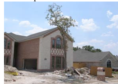
Fig 2. Typical site disruptions during home construction.

Urban development Many factors in urban environments stress trees. Construction damage, for example, wounds roots and causes site disruption that result in tree stress and decline. Constructing swimming pools, sidewalks, patios, and driveways can damage essential roots and root flares that provide necessary water and minerals for a healthy tree. Soil compaction and addition of fill soil cause drainage issues and suffocate roots. All these factors set in motion a chain of events leading to stress, decline and tree death (Figure 2). During decline, Hypoxylon attacks the trees and contributes to their mortality.